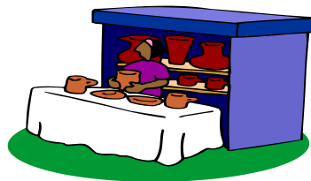
Table Space on

9 - 2 pm at Senior Center 70 Temple St. Nashua, NH 03060